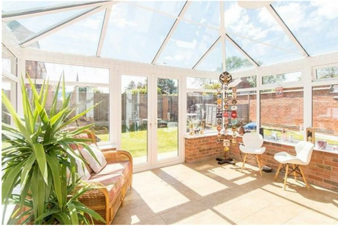
Conservatory 13'1" x 14'0" (3.99 x 4.27)

Modern upvc double glazed conservatory with clear pitched roof. Tiled flooring. Two radiators. Double glazed French doors opening out to the rear garden.