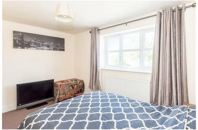
Bedroom Three 12'9" x 9'3" (3.89 x 2.84)

Double glazed window to the front elevation. Radiator.