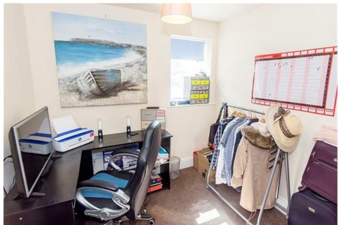
Bedroom Four 8'2" x 7'10" (2.49 x 2.39)

Double glazed window to the rear elevation. Radiator.