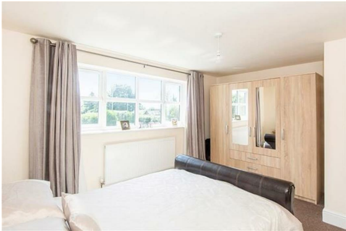
Bedroom Two 14'4" x 10'11" (4.39 x 3.33)

Double glazed window to the rear elevation. Radiator.